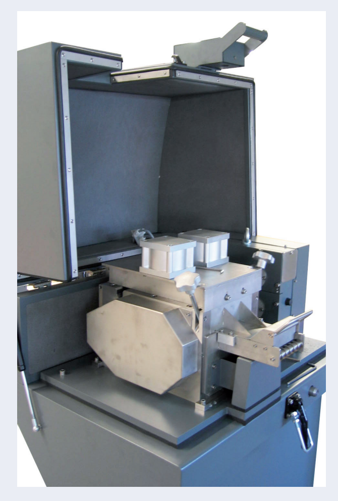
Optimum, safe accessibility to the cutting area, no electrical components on the cutting head housing