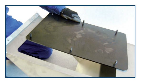
Pellet outlet with replaceable wear protection plate