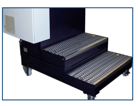
Sub-frame can be adjusted to suit the customer's requirements