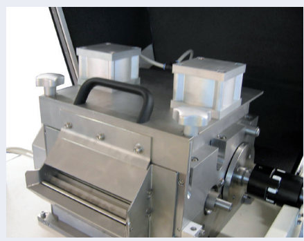
All sizes have two pneumatic cylinders on the upper feed roller for optimum feed action