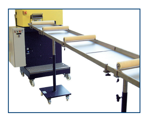
Strand feed from strand cooling trough to strand pelletizer

Other ips system components are available (strand die head, strand cooling trough, strand dewatering system, strand feed guide, classifier)