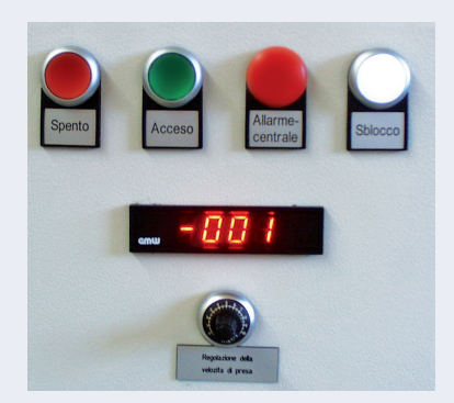
Robust, clear operating and display elements