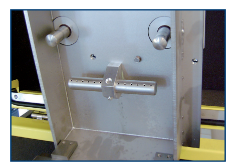
Cutting area cooling