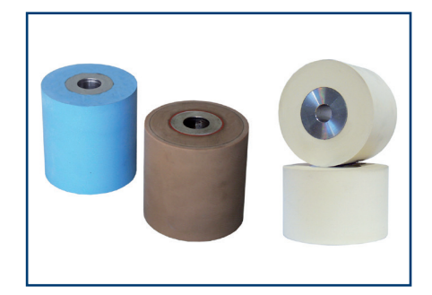
Various coatings for the upper feed roller